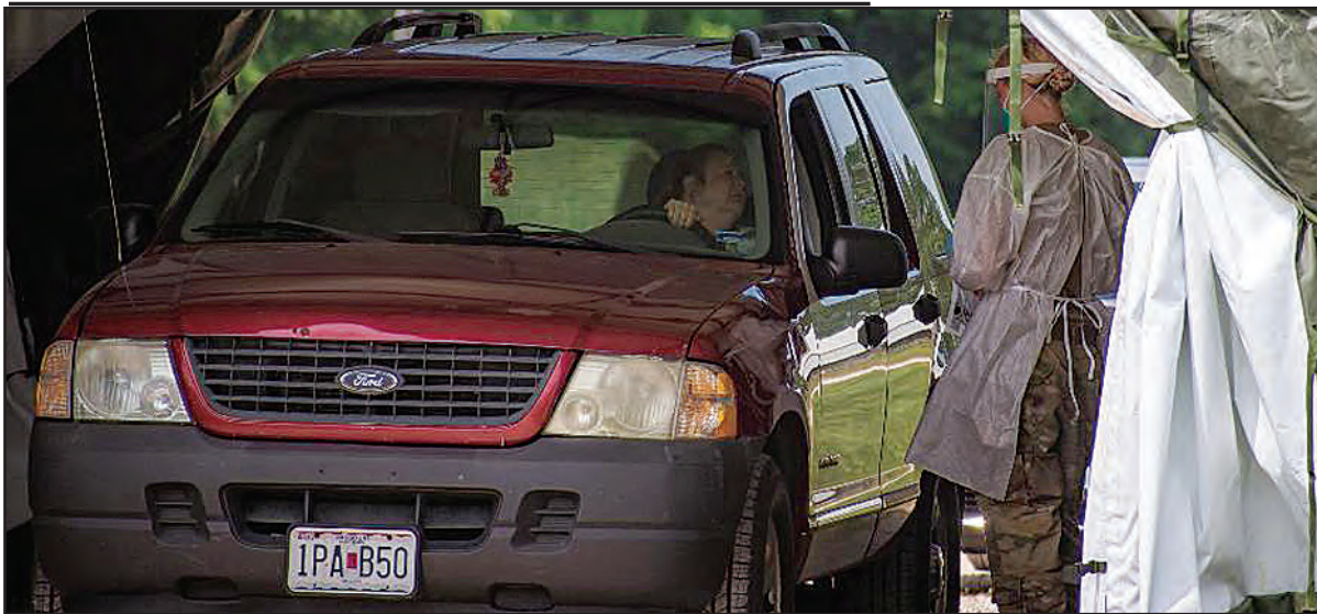
Pictured is an area resident being tested to COVID-19 at the Pike County Fairgrounds Friday, June 19.

On July 4: Anniversary celebration at the Clarksville Library, 1-4 p.m. Ice cream by Riverview Restaurant to celebrate Independence Day and the anniversary of the library, dedicated in 1910.