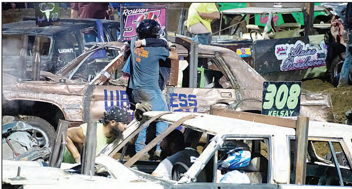
Pictured are members of car #53 Wreckless Redneck celebrating after the first round at the 2020 Pike County Fair demolition derby on Friday, July 31.