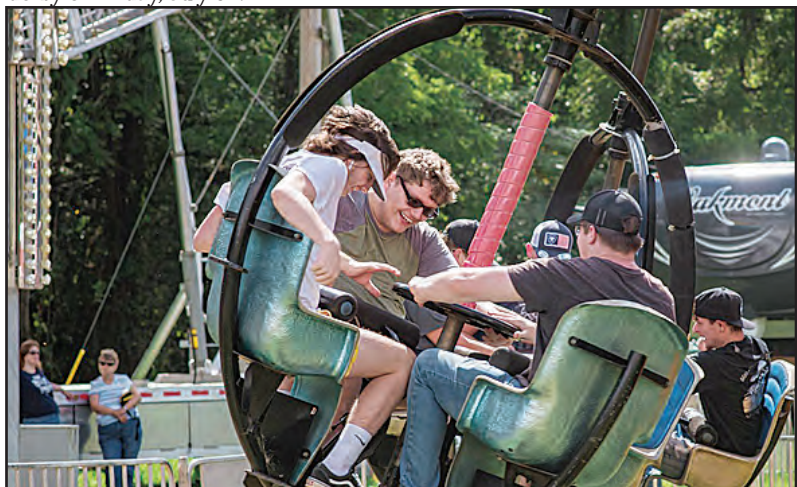
Carnival-goers enjoyed many rides on the midway at the 2020 Pike County Fair July 28-Aug. 1.