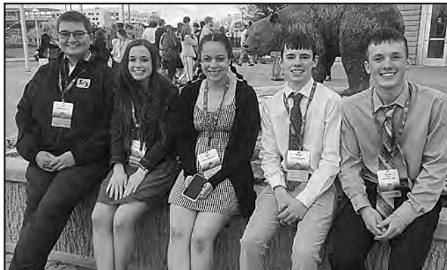
Clopton FBLA Members