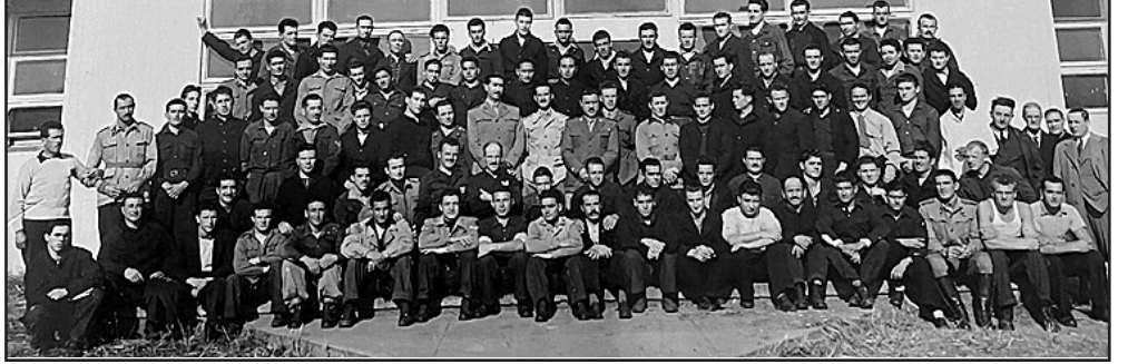
A photo of Italian prisoners of war held in Louisiana during World War II.

It wasn't until the profound, personal loss of her