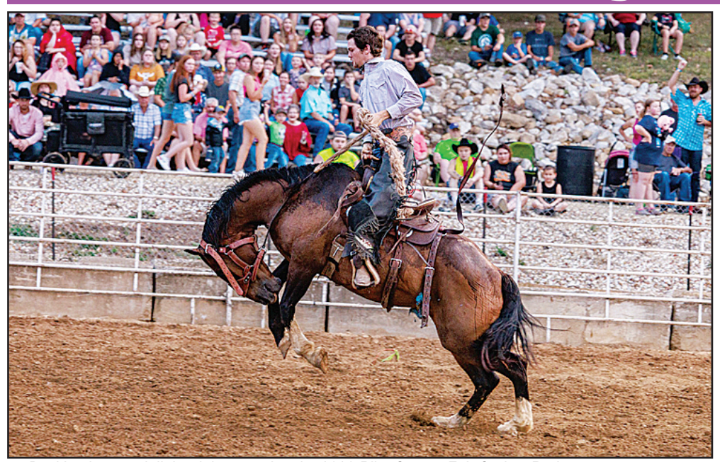
Bucking broncs delighted the crowd at the 2023 Pike County Fair Outlaw Rodeo.