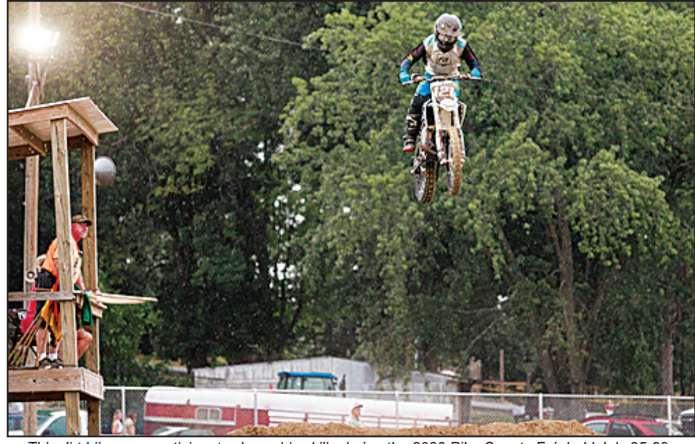
This dirt bike race participants shows his skills during the 2023 Pike County Fair held July 25-29.