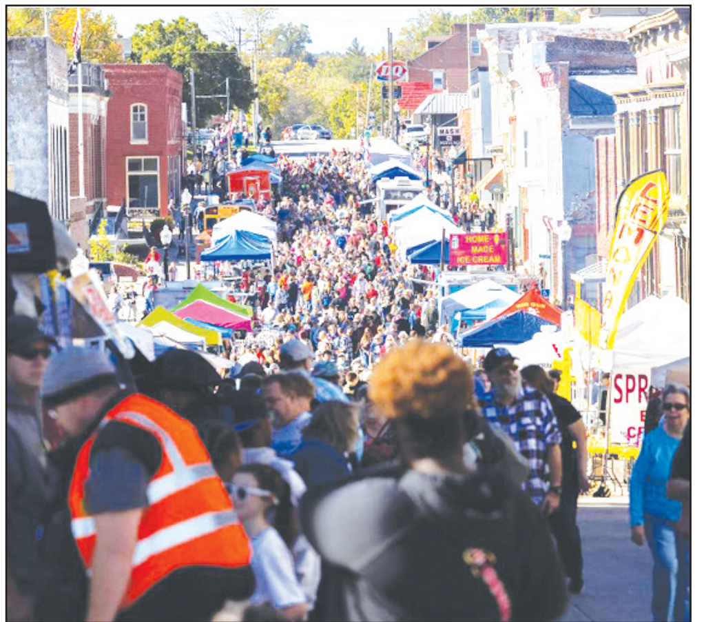
Georgia Street was full of spectators checking out the many Colorfest vendors just after the parade made its way down Georgia Street on Saturday, Oct. 21.