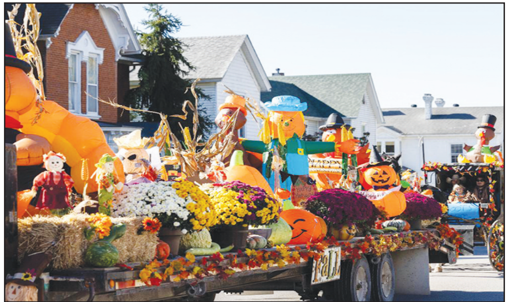
Boots Perchorn Farms brought the fall vibes with their themed float and a carriage during the parade at the 38th Annual Louisiana Country Colorfest held Saturday, Oct. 21 and Sunday, Oct. 22.