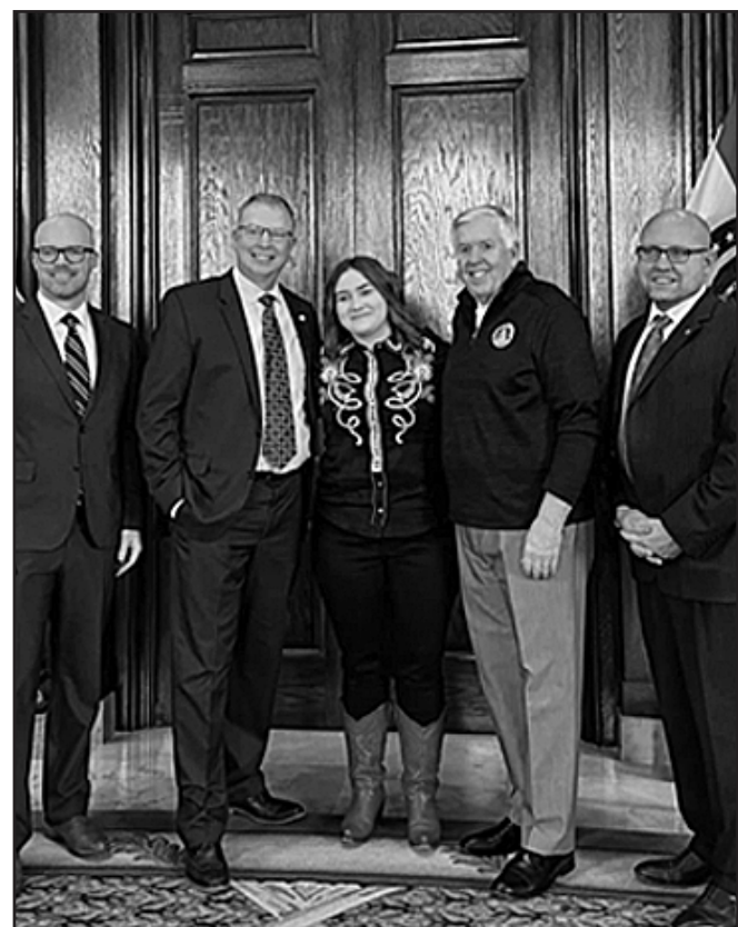
Governor Parson, along with Senator Fitzwater and Reps. Perkins and Doyle hosting Ruby in the Governor's Office.

HB 2170 introduces the "Missouri Rural Access to Capital Act," promoting economic development by offering tax credits to investors making capital investments in rural funds. The credits start at zero percent for the first two years and rise to 15 percent for the subsequent four years, with an annual cap of $16 million. Rural funds must undergo an approval process, adhere to investment criteria, and could face credit recapture for non-compliance. Eligible businesses must meet specific criteria, and rural funds are required to submit annual reports. The program sunsets on Aug. 28, 2030.