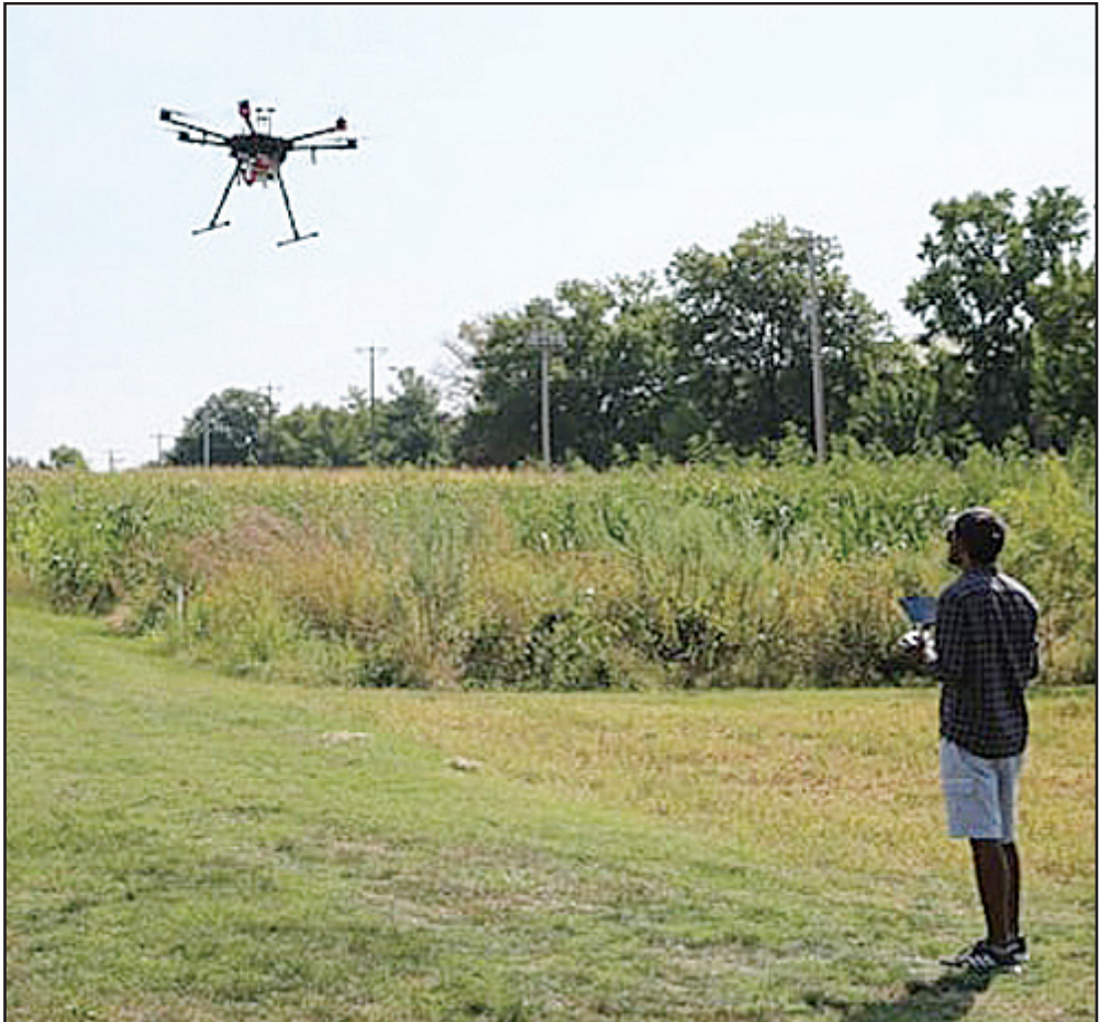
Mizzou's new Digital Agriculture Research and Extension Center will enhance research, education and outreach in emerging digital technologies for farming.