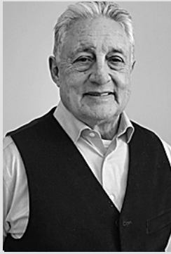
JIM ARICO, MAYOR CITY OF BOWLING GREEN

It is National League of Cities Month which recognizes towns like Bowling Green and how it is developing housing, excellent school scores, State of Missouri student organizations accomplishments and recognition, athletic, cheerleading, and music achievements, and special education as well as "gifted" programs in student inclusion. NLC recognizes city growth and achievements in infrastructure, street and roads improvements, utilities availability, plus businesses and civic development. National League of Cities is the oldest and largest non-partisan organization representing municipal governments. It works to strengthen local leaders, drive innovation, and influences federal policies that impact local operations.