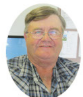
Les Ori Agent