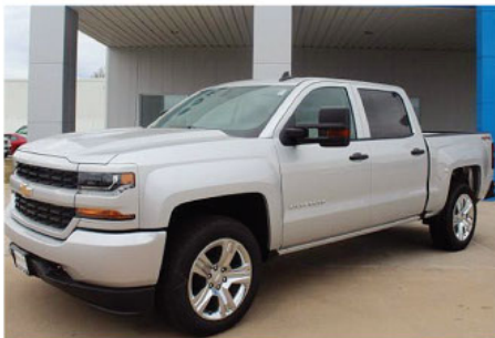
Chevy Crew Cab 4x4