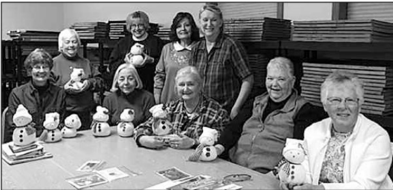
GFWC Chautauqua Talks About The Holidays

Individuals arrested are presumed innocent until proven guilty.