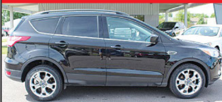
2015 FORD ESCAPE SE Leather, Back-up camera $15,655