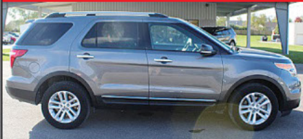
2014 FORD EXPLORER XLT Leather heated seats, 4x4 $27,990