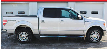
2014 F-150 LARIAT SUPERCREW Leather, PW/PL $32,990