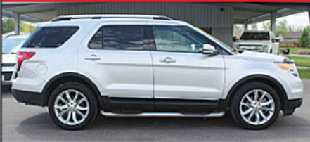
2015 FORD EXPLORER LMTD Leather, Navigation, Bluetooth $29,995