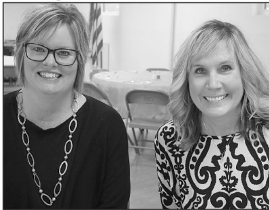
Representatives of The Aviary discussed the services they offer during the Ecumenical Women's Breakfast Group's meeting recently.

During the business meeting it was decided to donate proceeds from the breakfast to Pike Pioneer Nutrition Center and also the local