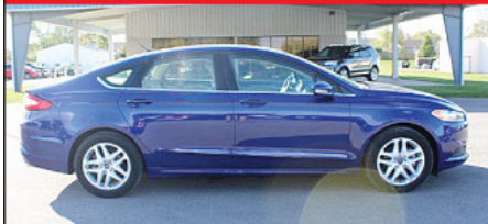
2014 FORD FUSION SE Bluetooth, Cruise $16,995