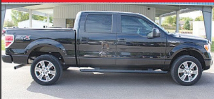
2014 FORD F-150 STX SUPERCREW AWD, bedliner, running boards $28,995