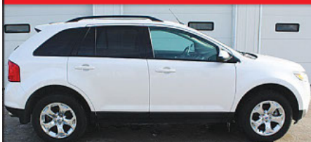
2014 FORD EDGE SEL AWD, Power Driver Seat $23,995