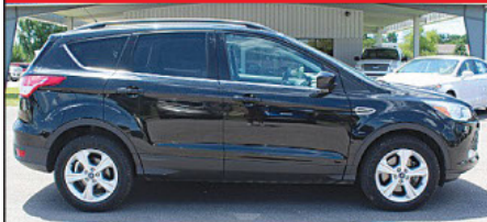
2014 FORD ESCAPE SE Back-up camera, Sirius XM $12,990