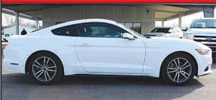
2016 FORD MUSTANG Ecoboost $19,995