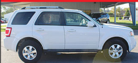
2009 FORD ESCAPE LIMITED Sunroof, Bluetooth $7,995