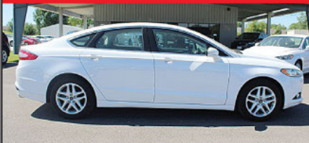
2014 FORD FUSION SE Leather, back-up camera $16,995