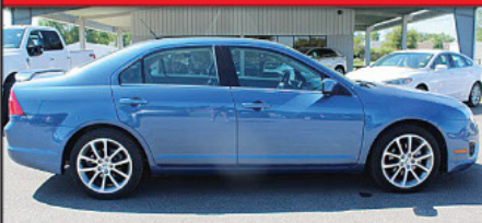
2010 FORD FUSION SEL Leather seats, sunroof $11,995