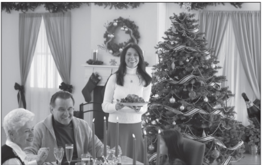
Hosts can employ various strategies to simplify the process of cooking for a crowd this holiday season.