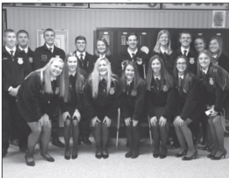
Pictured are Silex FFA Members that participated in the Area V Fall Public Speaking Contests.