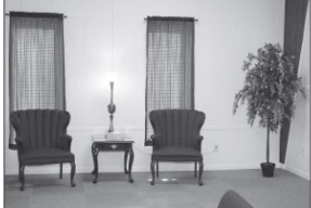
A small sitting area was placed in the back of the chapel area of Binshoff Funeral Home in Vandala.