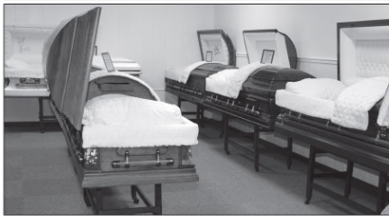
Pictured is the casket inventory room at the newly remodeled Binshoff Funeral Home in Vandala. This room houses the on-hand caskets to choose from along with vault samples and urns for those choosing to be cremated.