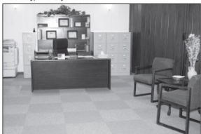
Pictured is the office and consultation area of the Vandala location of Binshoff Funeral Home.

Find more details about the company and the services they offer online at binshofffuneralhomes.com .