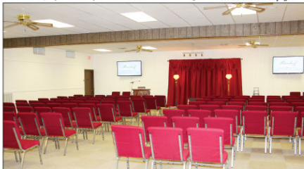
Pictured is the newly remodeled chapel area of Bienhoff Funeral Home in Vandalia. The new location of Bienhoff Funeral Home in Vandalia officially opened for business late last week after approximately six months of remodeling work to the former Vandalia VFW Hall.