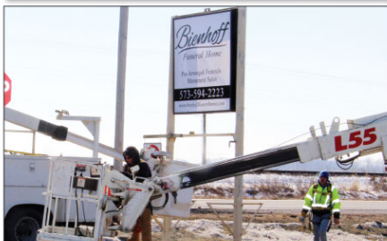
Pictured is the Highway 54 west sign for Bienhoff Funeral Home in Vandalia that was switched from VFW Post 2173 sign. The former VFW Hall was purchased in July 2018 by Bienhoff Funeral Home's owners, Clyde and Cheryl Olguschlaeger. The facility is located at 100 Gault Road.

Published Every Tuesday • Vol 24 - No. 17 • Tuesday, February 5, 2019 • Online at www.thepeopletribune.com FREE