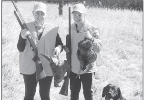
Women and youth looking to get a start in the sport of upland bird hunting have an ideal opportunity with MDC's Youth and Women's Pheasant Clinic and Hunts, both being held in February by the August A. Busch Shooting Range and Outdoor Education Center.

For more information call 636-441-4554, extension 1550. The August A. Busch Shooting Range and Outdoor Education Center is located at 3550 Route D in Defiance, approximately five miles west of Highway 94.