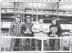
Missouri Welding Institute Competitors

Many of our students will have the opportunity to head to state level competitions in April. We are excited