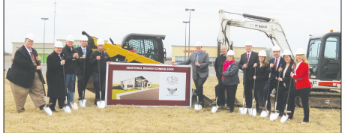
Community State Bank broke ground on Tuesday, March 12 on a new facility to be constructed in the Bowling Green Town Center. Pictured are the board of directors of Community State Bank of Missouri along with employees at the groundbreaking event last week. A rendering shows what the facility will look like upon completion as a second location for the bank in town.