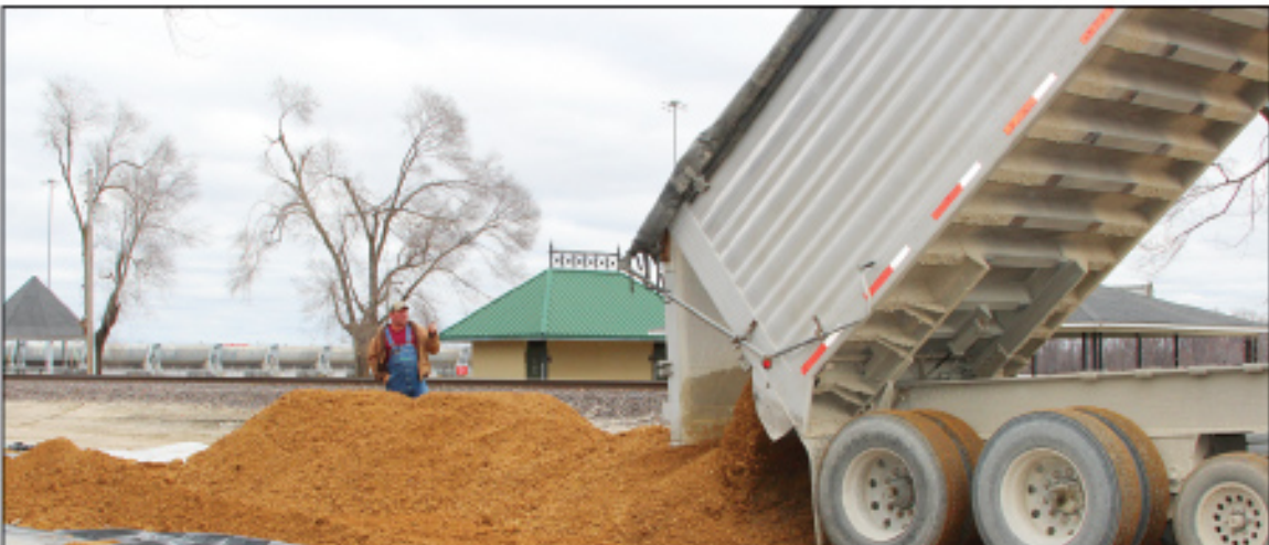
Love & Sons helped to bring in loads of sand starting last week to help construct the seven-foot temporary levy along First Street in Clarksville as the town prepares for predicted flooding.