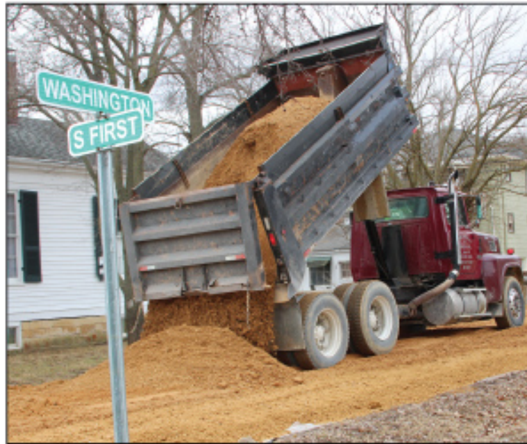
Sand is dumped on Washington Street at the corner of First Street where a seven-foot barrier has been constructed to help protect downtown Clarksville from predicted flooding.

https://extension2.missouri.edu/programs/century-farms/century-farms-apply .