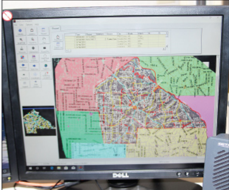
Computer monitors at each dispatch station has enhanced maps to help guide emergency personnel where they need to go. The county is currently having the mapping system upgraded. That work should be done within the next month as dispatchers move to the new facility.