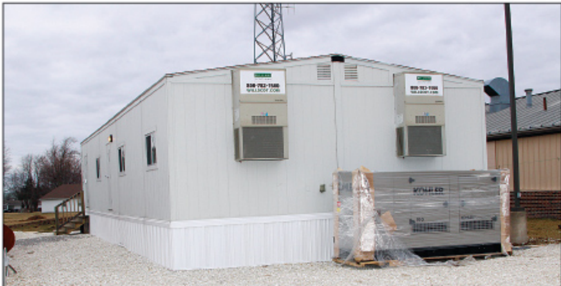
Operations for Pike County 911 will soon be housed completely in this trailer located directly behind the Pike County Sheriff's Department. For many years the operation was split with dispatchers operating out of the Sheriff's Department in addition to a satellite station in the Louisiana Police Department out of city hall. Voters recently opted to combine and vastly improve 911 operations. The trailer has been transformed to include a dispatch area with three stations, a training room, break room, conference room (where future 911 meetings will take place) and offices for the 911 director and an assistant. It is currently planned to have dispatchers moved into the trailer within the next month.