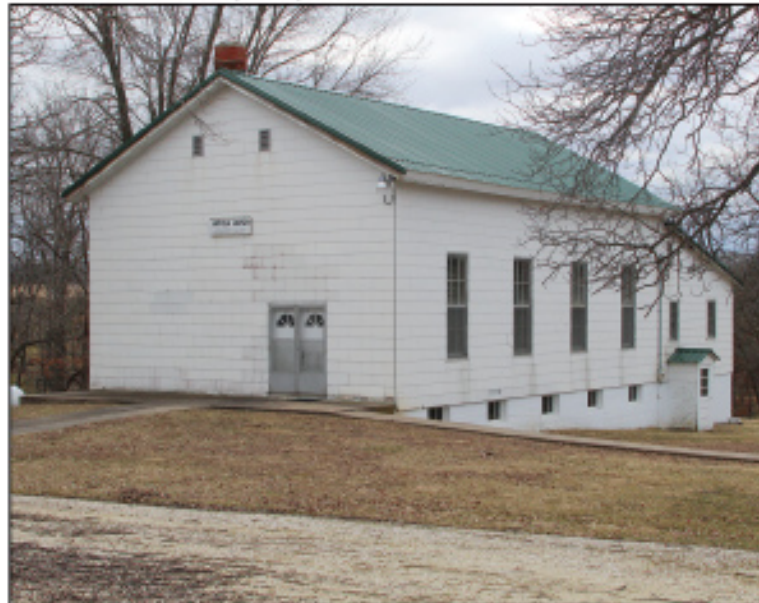
Pictured is the Antioch Presbyterian Church located at 21013 Pike 309. The church will celebrate its 200th anniversary on Sunday, May 26.

All are welcome to attend the services and refreshments after the second program.