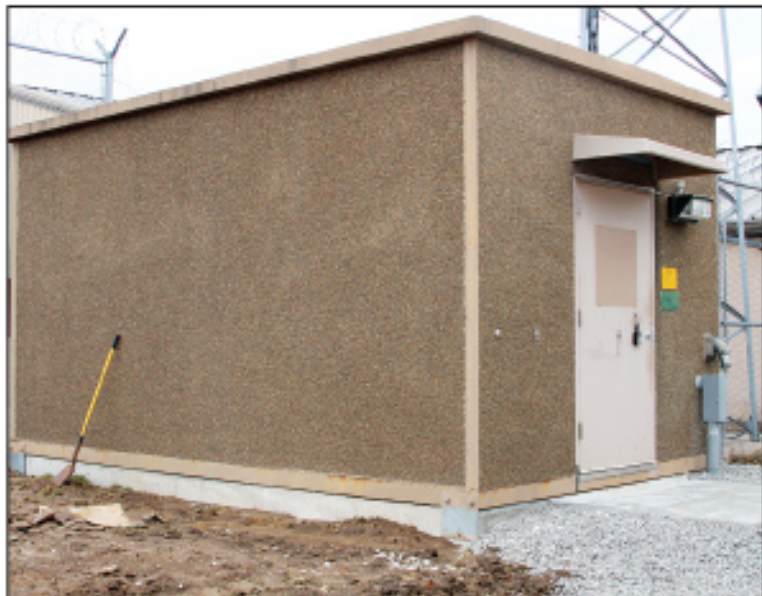
The county commissioned construction of a secure building behind the Pike County Sheriff's Office, next to the 911 trailer, that houses all of the servers, recording equipment and other technology. Dispatchers can be moved into the building to operate if a new facility is constructed in the future.