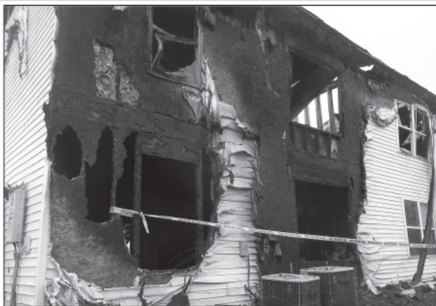
Fire at the Creekside Apartments in Bowling Green caused major structural damage.