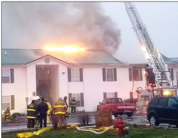
Flames break through the roof Friday morning at the Creekside Apartments in Bowling Green. There were no injuries and 20 people from seven affected apartments had to be relocated.

Published Every Tuesday • Vol. 24 - No. 25 • Tuesday, April 9, 2019 • Online at www.thepeopletribune.com