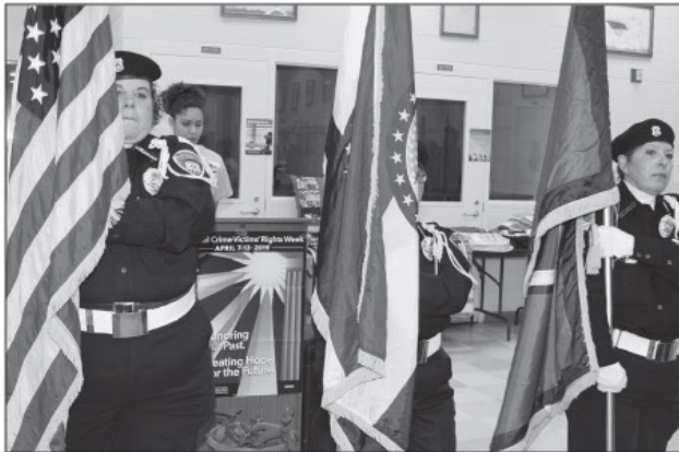
The presentation of colors during the event at WERDCC to mark National Crime Victims' Rights Week.