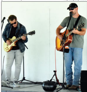
Fair-goers enjoyed country music at the Tim Allen concert on the small stage on Saturday.