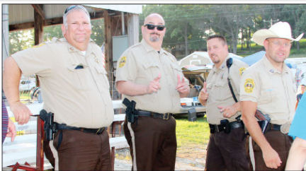
Members of the Pike County Sheriff's Department spent the week providing security at the fair.