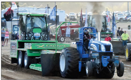
The 2019 Pike County Fair wrapped up on Saturday night with the Lucas Oil Pro Pulling League Champion Seed Western Series tractor and truck pull. The event featured several classes and events throughout the night.